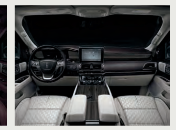
Blue Bay/Alpine Leather Whitewashed Teak